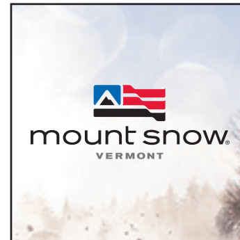
Light color/texture in area with negative space