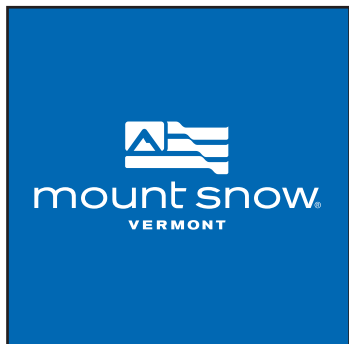
White on dark background